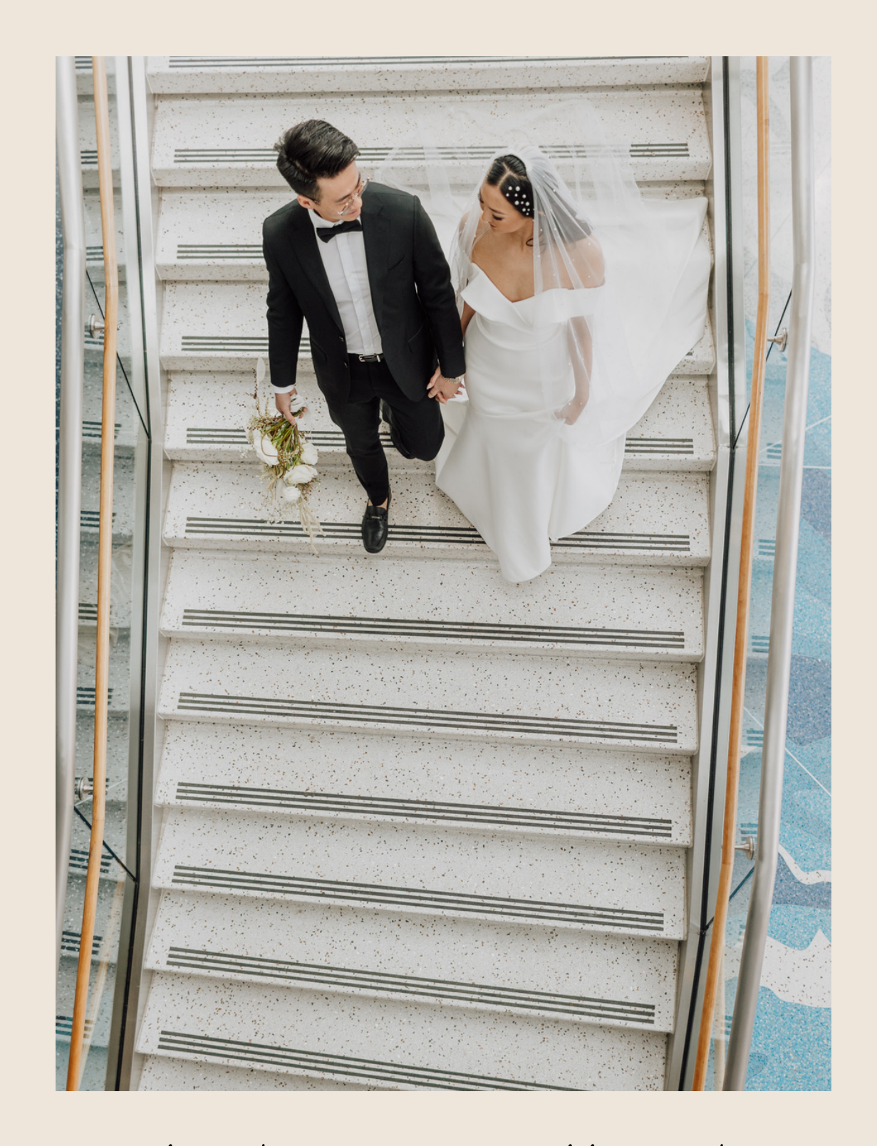
and picture your wedding at The Cable Center